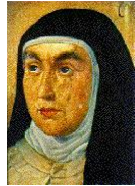
Illustration: Teresa of Avila